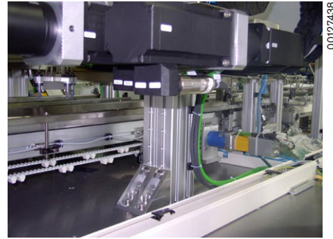
Fig. 2 With positive-locking connectors, the Cartesian Motion building system achieves a level of accuracy in the supporting structure that could previously only be attained with custom-fabricated parts.